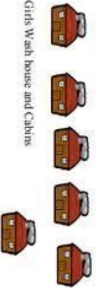
Girls Wash house and Cabins