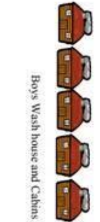
Boys Wash house and Cabins