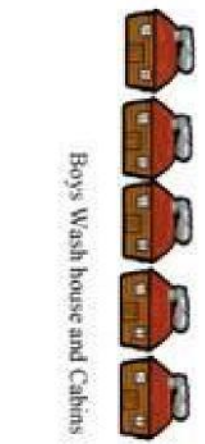
Boys Wash house and Cabins